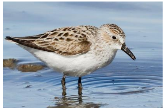
Pictured is a Semipalmated sandpiper with a single Horseshoe Crab egg which it captured by "piping away" at the sand in Fortescue during migration on May 23, 2015. This bird is 5.1-5.9 inches long and weighs around 0.7-1.1 oz

This annual event occurs during May, between full moons. Our observation was near the supposed peak. You will need to wait until next May to enjoy this outing. If you go there you'll love it!