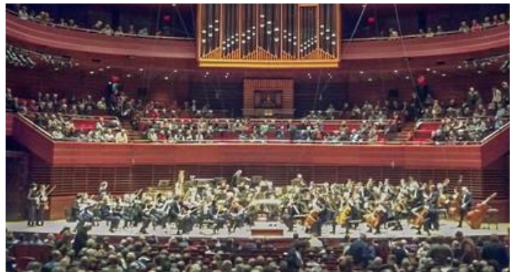
The Philly Pops onstage - the Conductor's Circle is directly above the orchestra.