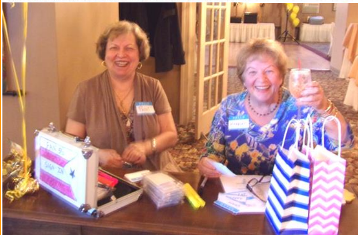
Friendly faces greeted Fantastic 50's members and guests as they checked into Touch of Class in Delran on May 17th.